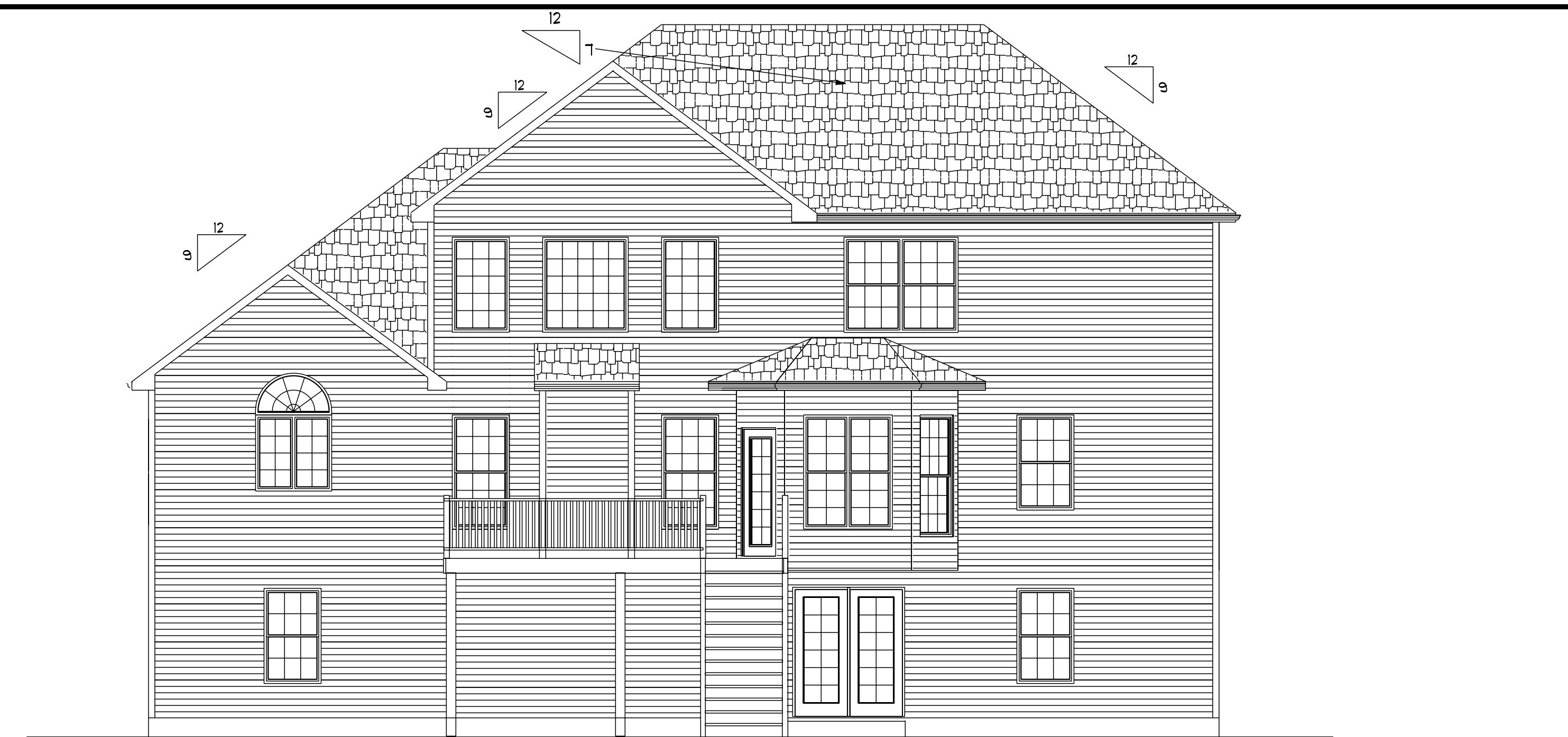
BACK ELEVATION 3/16"=1'-0"

• POINT LOAD FROM ABOVE PROVIDE THE FOLLOWING: 1) SOLID BLOCKING BETWEEN BEAM (OR BILL) AND FLYWOOD SUBFLOOR 2) A MINIMUM OF THREE STUDS IN A BEARING WALL AS BEAM JACKS.