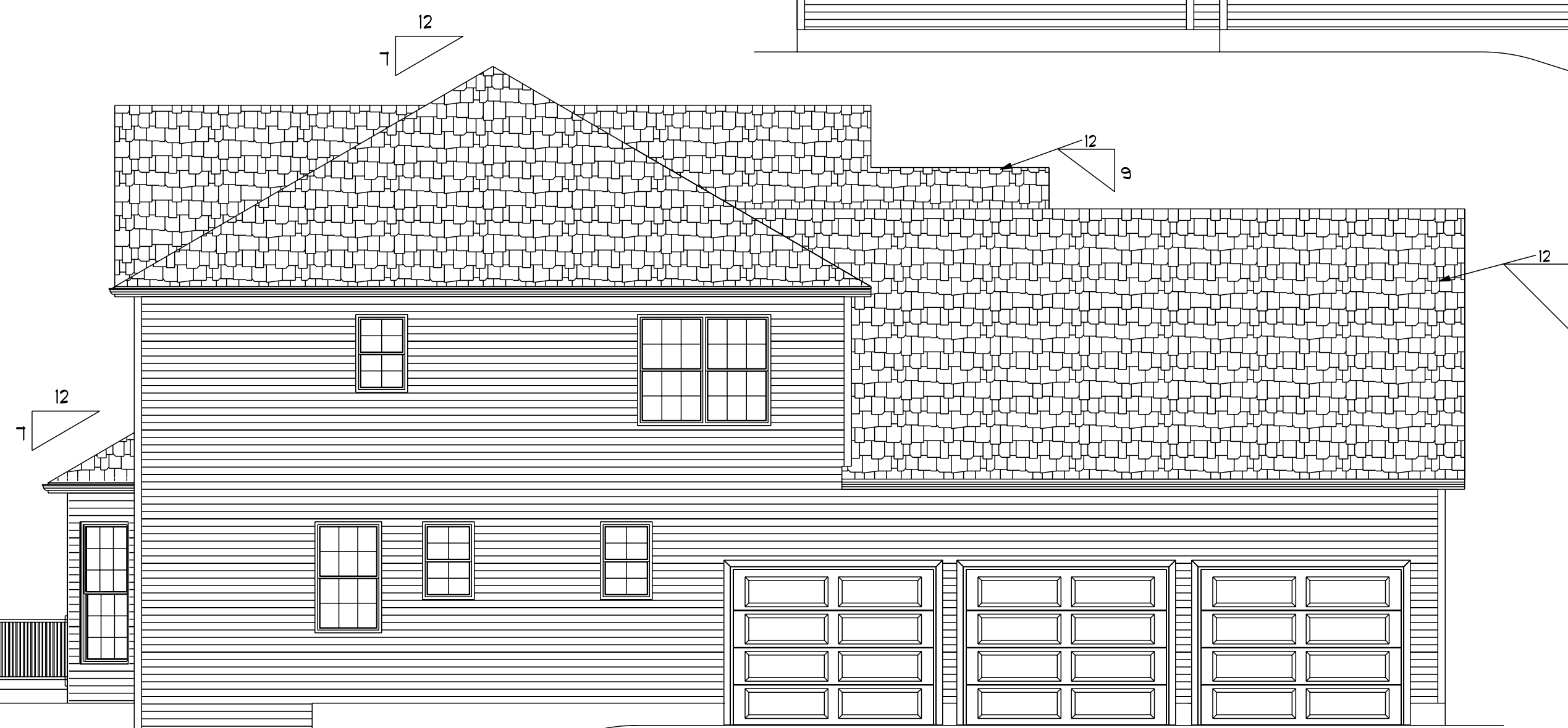
LEFT SIDE ELEVATION 3/16"=1'-0"

NOTE: ALL DROPS IN FOUNDATION, WINDOWS AND DOORS ARE SITE PENDING AND ARE UP TO THE DISCRETION OF THE BUILDER / CONTRACTOR.